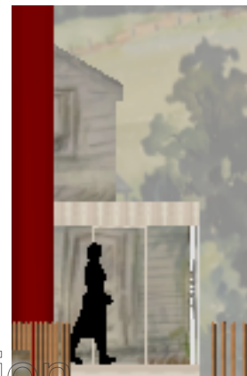
2 TD.CWArablesPorch Scale: 3/4" = 1'-0"